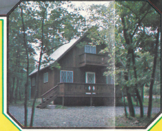
"A place for your own private retreat for a weekend, a vacation, or the rest of your life".

All photographs are actual scenes at Bear Creek Lake.