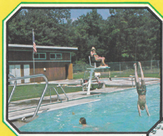
"Olympic size swimming Pool, Wading Pool, Dressing Rooms."