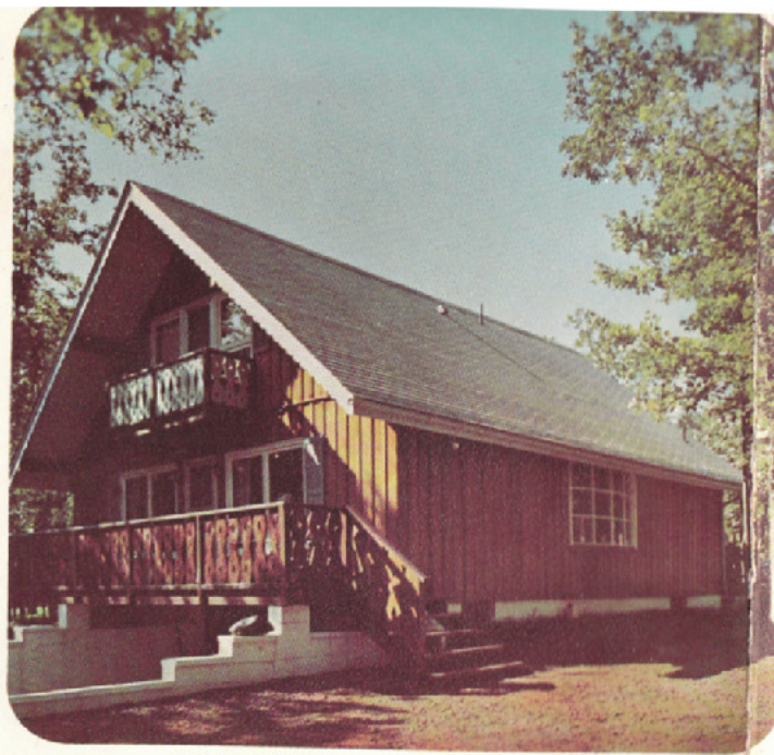
TYPICAL HOMES AT BEAR CREEK LAKES