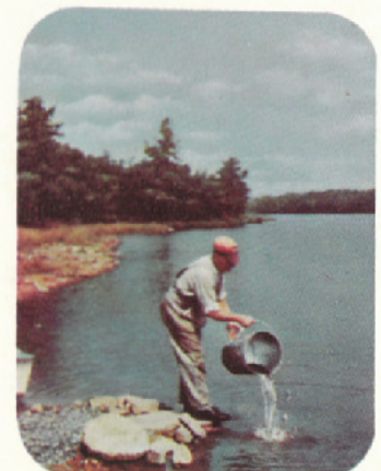
STOCKING LAKE WITH TROUT