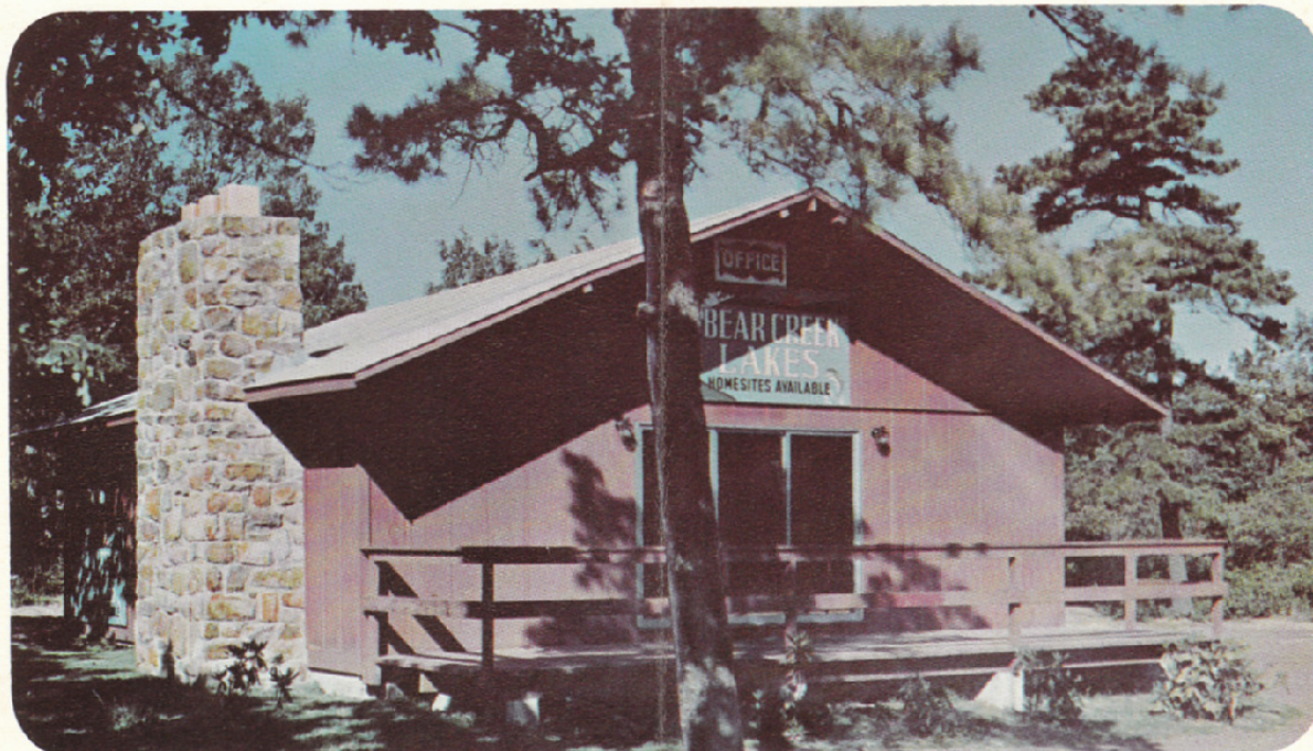
BEAR CREEK LAKES SALES OFFICE